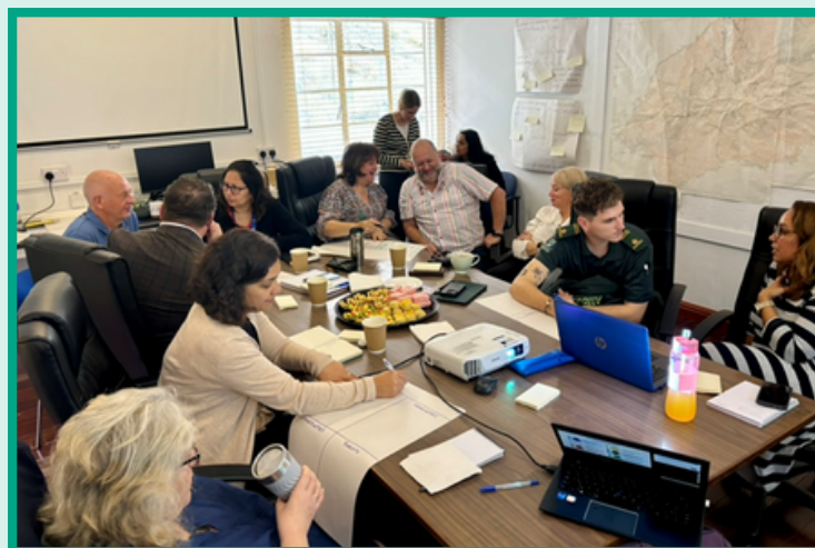
Workshop with colleagues in St Helena