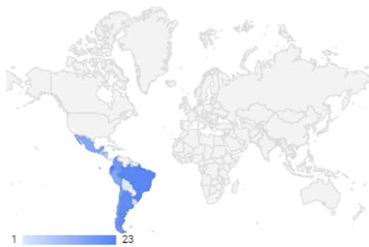
Map of visits by country and by Africa, Asia, Latin America, and the Caribbean