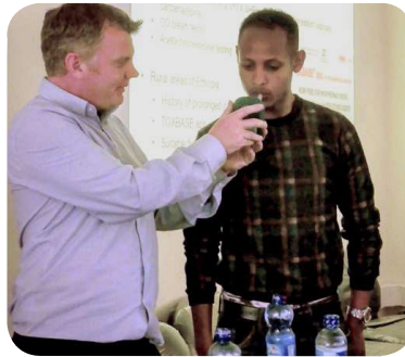
Toxicology training workshop at the Ethiopia Public Health Institute