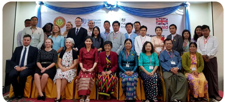
Emergency Incident Management Training with the Myanmar Ministry of Health and Sports

UK Health Security Agency is an executive agency of the UK Department for Health and Social Care For more information about what we do please visit our website or email us at IHR.Programme@phe.gov.uk Follow us on twitter @UKHSA #IHR_Strengthening