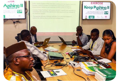
Public health emergency simulation exercise at the Nigeria Centre for Disease Control