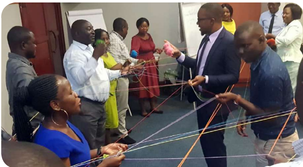
Laboratory Leadership Training for Resilient National Public Health Laboratories in Zambia and across Nigeria and Ethiopia