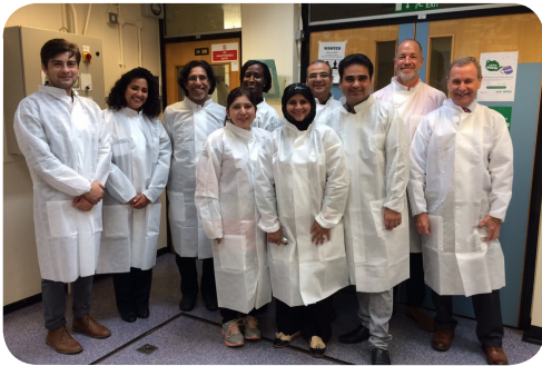
Study visit to UKHSA's laboratories from Pakistan's National Institute of Health and Kyhber Pakhtunkhwa Public Health Laboratory