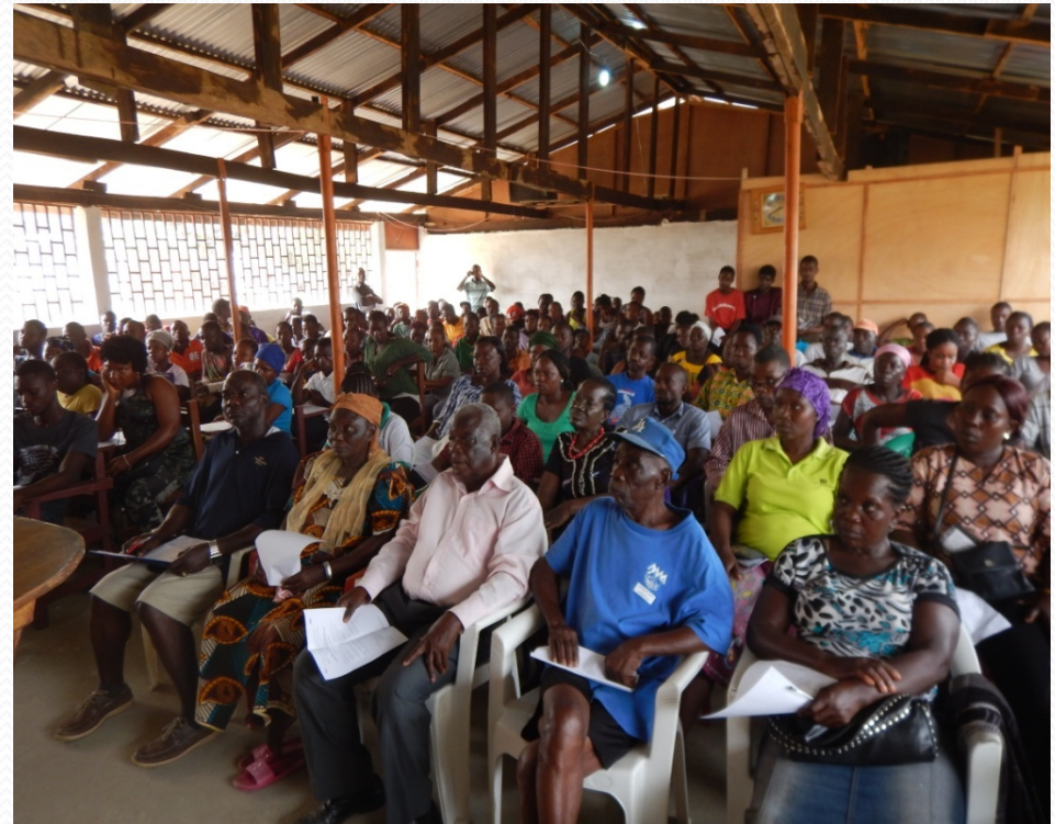
Community engagement in Cow field, Duport Road

Community outreach to targeted population involving community leaders, religious and traditional leaders through community meetings and IPC, using posters, flyers, FAQs and other educational materials.