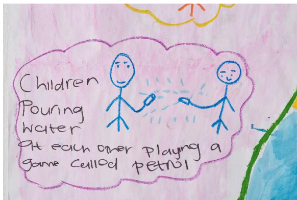
Children, water and recreation

The stories from the Delft group have been drawn into a series of 4 mini films, according to the 4 thematic areas that they fitted into