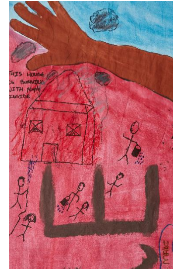
Water and Loss