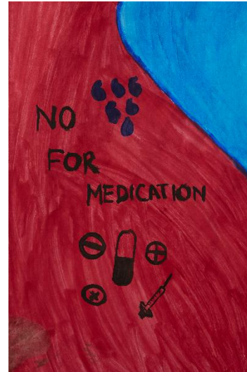
Health, stress and sanitation