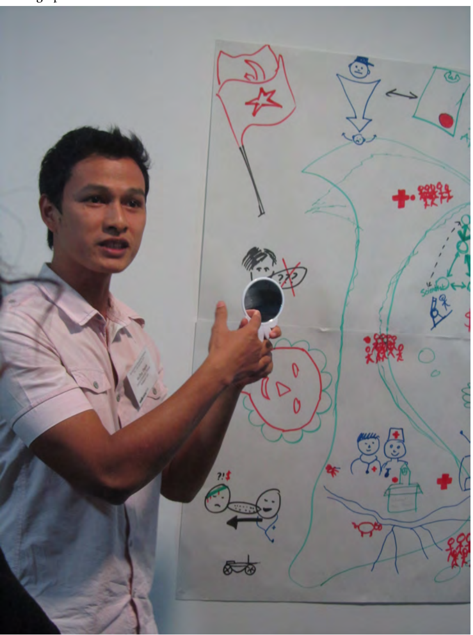
Image 3. A workshop participant emphasises the importance of trusting oneself and one's institution by holding up a mirror

"We need to trust in ourselves first. So this is a mirror. Looking in a mirror you can see exactly who you are and what you are doing. So you need to trust yourself before expecting the others to trust you."