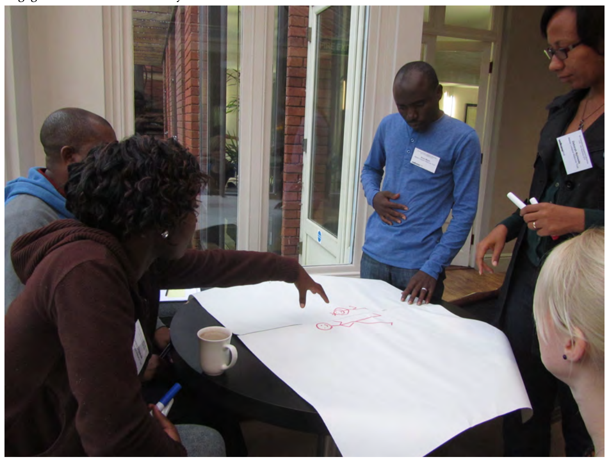
Image 1. Workshop participants develop a rich picture to explore how trust plays out in community engagement in research in Kenya