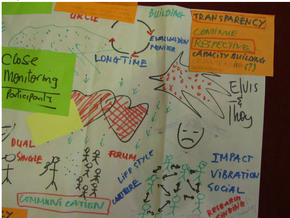
Image 2. The many different ingredients of building and maintaining trust were explored by participants during a World Café session

Trust needs to be built but also maintained. Workshop participants knew that they could not assume that they had established trust with their respective communities simply because they had been transparent about their work or had taken the time to meet with community representatives. Some descriptions of building and maintaining trust highlighted the ongoing work needed to maintain appropriate levels of trust to enable collaboration with communities without creating blind trust that leaves no room for scrutiny. Others described how fragile trust can be when unexpected events affect a community.