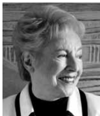
Dame Stephanie Shirley, Founder and President, Autistica

Since I founded the charity in 2004, Autistica has gone from strength to strength. It is now established as a pioneer in its field and the UK's leading charitable funder of autism research. This report shares the experiences and opinions of families living with autism across the UK, voices we too often do not hear. In placing families at the heart of its science strategy, Autistica continues its focus on research targeted to make a real difference, research aimed to produce tangible results in the sea of need. This consultation marks the beginning of an exciting new chapter for Autistica, and I urge all those who care about autism to lend their support however they can.