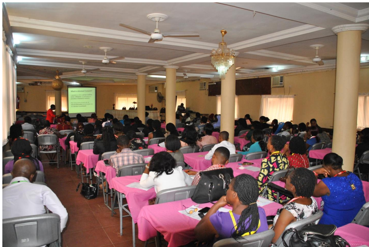
From 11:30-12:00 noon, the participants went for tea break/refreshments and were also introduced to how to register to become members on the GRN website,