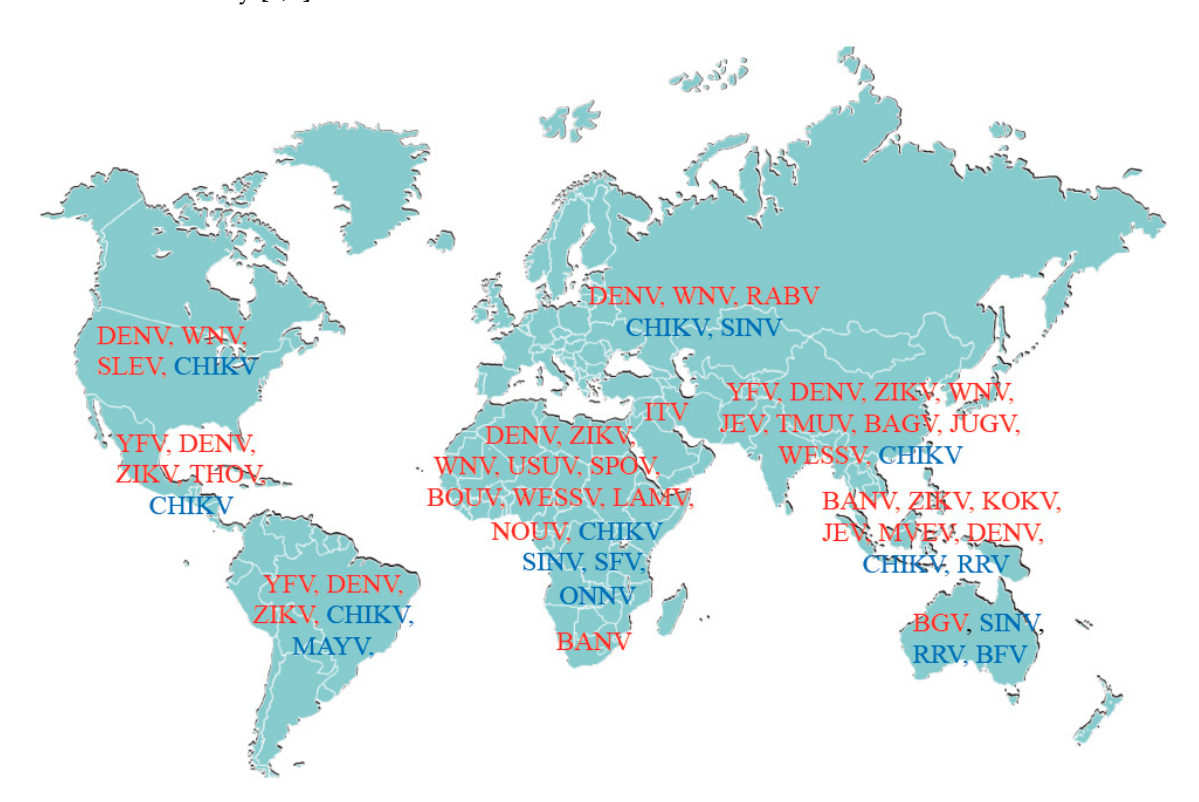
Figure 1. Non-exhaustive alphabetic list of flaviviruses (in red) and alphaviruses (in blue) and their geographical localization. Flaviviruses: Bagaza virus (BAGV), Bamaga virus (BGV), Banzi virus (BANV), Bouboui virus (BOUV), Dengue virus (DENV), Israel Turkey meningoencephalomyelitis (ITV), Japanese encephalitis virus (JEV), Jugra virus (JUGV), Kokobera virus (KOKV), Lamni virus (LAMV), Murray Valley encephalitis virus (MVEV), Nouanamé virus (NOUV), Rabensburg virus (RABV), Saint Louis encephalitis virus (SLEV), Spondweni virus (SPOV), Tembusu virus (TMUV), T'Ho virus (THOV), Usutu virus (USUV), Wesselsbron virus (WESSV), West Nile virus (WNV), yellow fever virus (YFV) and Zika virus (ZIKV). Alphaviruses: Barmah forest virus (BFV), Chikungunya virus (CHIKV), Mayaro virus (MAYV), O'nyong-nyong virus (ONNV), Ross River virus (RRV), Semliki forest virus (SFV) and Sindbis virus (SINV).

Globally, millions of people are infected each year by arboviruses that cause epidemics, spread by the day-biting of the Aedes (Ae.) aegypti mosquito, which is the primary vector [3]. This mosquito evolved from the sylvan African Ae. formosus to become an anthropophilic species that breeds in urban environments and feeds primarily on humans [4]. In contrast to the typically sylvatic outbreaks of CHIKV that occur in Africa, a single amino acid mutation in the E1 envelop protein adapted the CHIKV to Ae. albopictus , a vector that readily adapts to diverse environmental conditions. Importantly, the past three decades have seen a dramatic global expansion in the geographic distribution of Ae. albopictus that continues today [5,6].