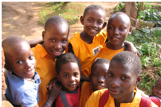
Children in Uganda

It is important to establish affordable systems that sample medicines in a representative way and robust laboratory techniques to analyse them on a regular basis. This will allow us to accurately quantify and track the scale of poor quality medicines that threaten the treatment of this life threatening disease.