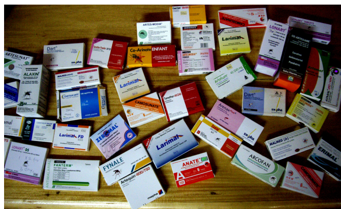
Packets of artemisinin-containing antimalarials analysed by the ACT Consortium