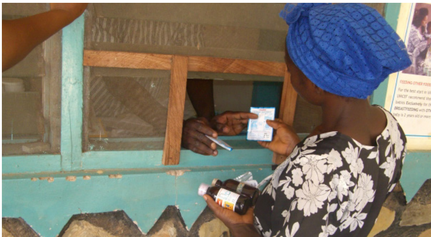
Woman obtains medicines in Ghana

The Artemisinin-based Combination Therapy (ACT) Consortium Drug Quality programme collected and analysed the quality of over 10,000 artemisinin-based drugs from six malaria endemic countries: Cambodia, Equatorial Guinea, Ghana, Nigeria, Rwanda and Tanzania.